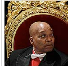
Leaders' Lavishness Gives Rise to 'Lifestyle Audits'