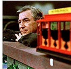
'Mister Rogers' Still Big in Pittsburgh