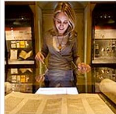
Where the Jewish Star Meets the Union Jack