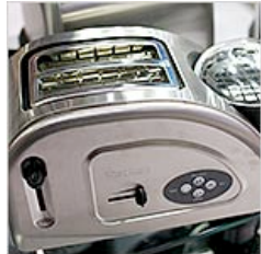
Taking the Fast-Food Mentality Into the Home